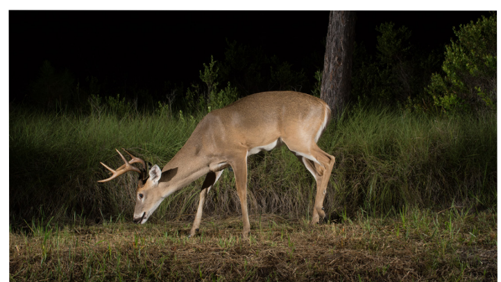
A white-tailed deer grazes in a protected area of longleaf pine and grass habitat north of the Caloosahatchee River.