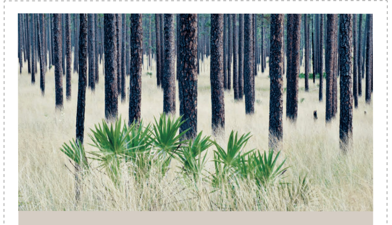
Longleaf pines stand over an understory of palmettos and wire grass in Ocala National Forest.