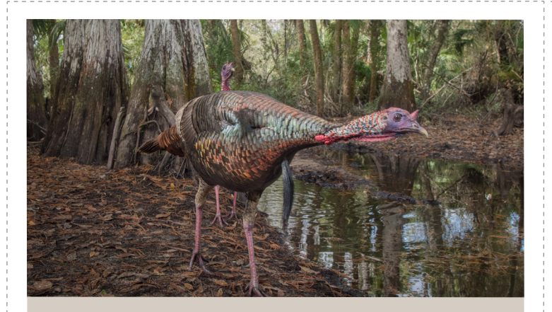
The Osceola variety of the American turkey thrives in Florida woodlands and swamps, here south of the Caloosahatchee River.