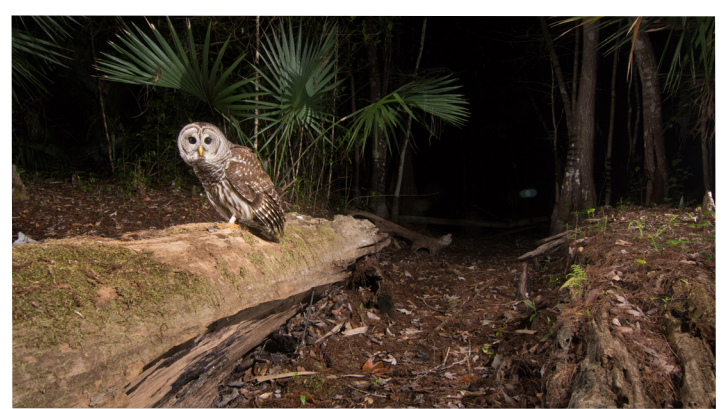
A burrowing owl in the Everglades Headwaters area holds a mole cricket, possibly its next meal.