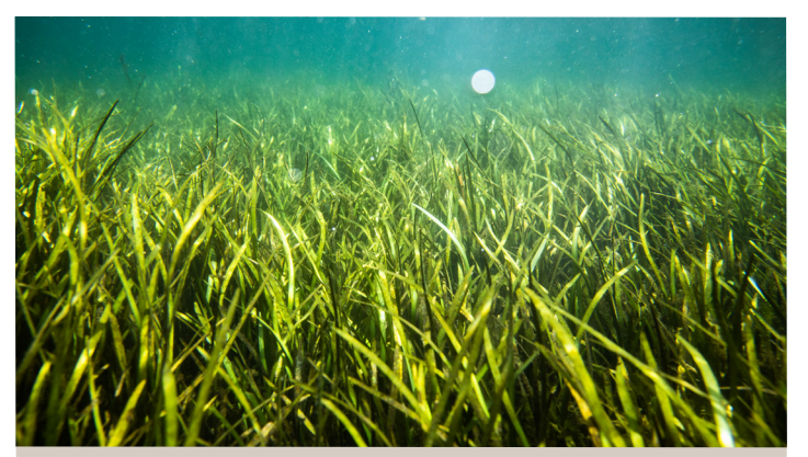
Sea grasses grow in bays, lagoons, and shallow coastal waters, providing habitat for a diversity of marine animals.