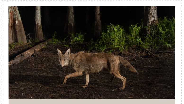
Coyotes, considered an invasive species, can survive in habitats with few panthers as predators.