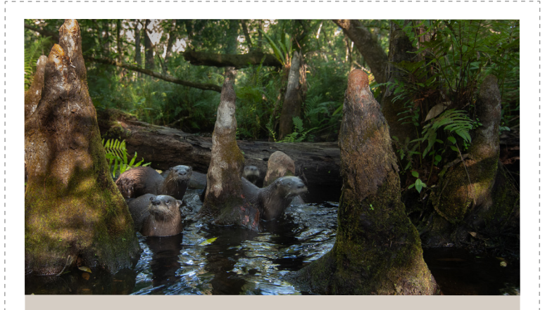
Otters hunt along submerged swamp trails in the Florida Panther National Wildlife Refuge.