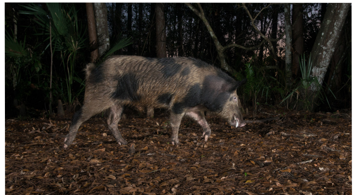
Wild hogs, an invasive species destructive to native landscapes and ranchlands, are a food source for Florida panthers.