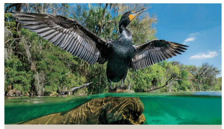
A double-crested cormorant dries its wings from a submerged log in the spring-fed Rainbow River.