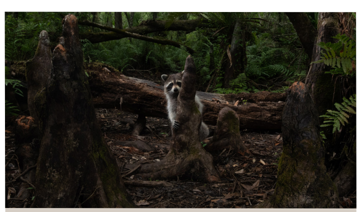
A raccoon eyes the camera trap set in the Fakahatchee Strand within the Florida Panther National Wildlife Refuge.