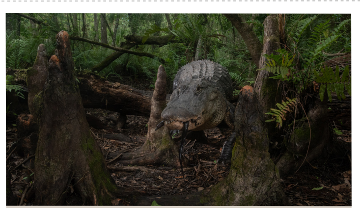
An American alligator carries a large salamander called an amphiuma through a cypress forest.