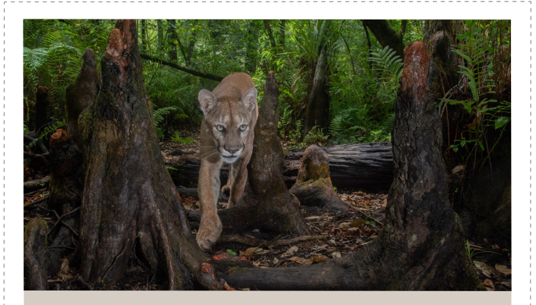
A male Florida panther leaps over swamp water as he patrols his territory in Florida Panther National Wildlife Refuge.