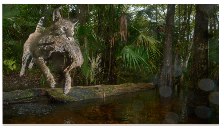
Carrying a marsh rabbit, a bobcat flies over a swamped log in the Florida Panther National Wildlife Refuge.