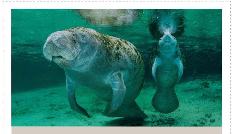
A \boldsymbol{manatee} mother and calf seek refuge from the cold Gulf of Mexico in the spring-fed Crystal River National Wildlife Refuge.