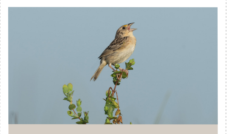
A grasshopper sparrow, among the most endangered birds in North America, perches in the Everglades Headwaters area.