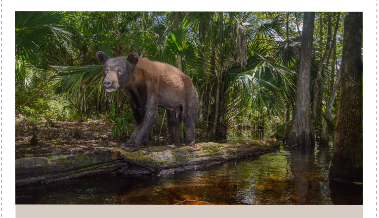
A black bear travels through its vast range near a 500-yearold cypress tree.