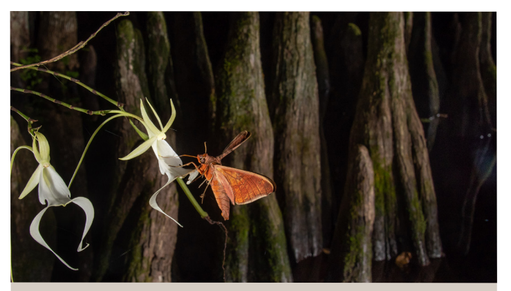
A sphinx moth potentially pollinates a rare ghost orchid within the Florida Panther National Wildlife Refuge.